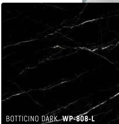
BOTTICINO DARK WP-808-L