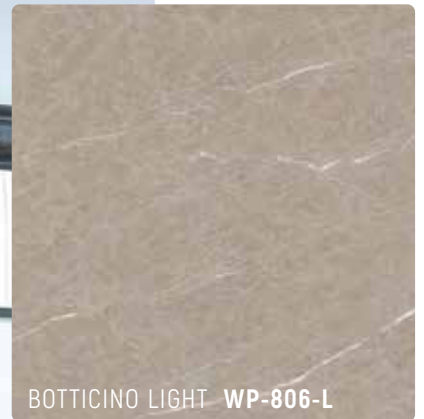
BOTTICINO LIGHT WP-806-L