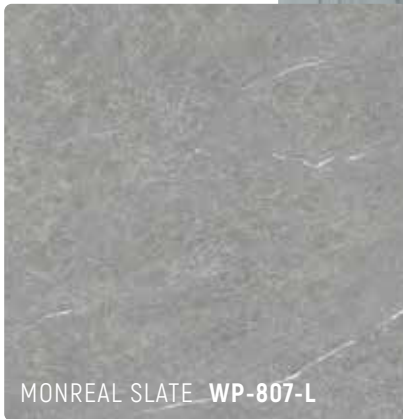
MONREAL SLATE WP-807-L