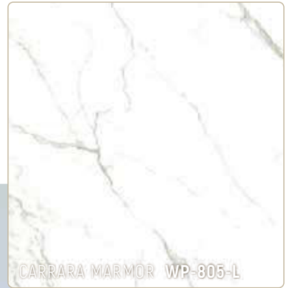
CARRARA MARMOR WP-805-L